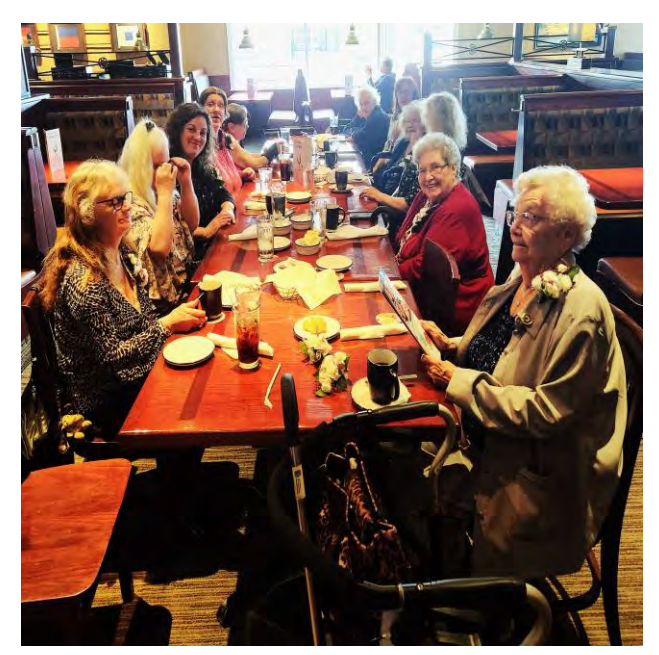
L.A wind up at Red Lobster May 7, 2023