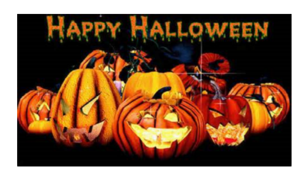
Best Costume Prizes Band Marvells 8:00 PM