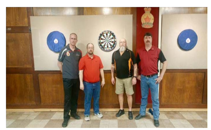
The Team from St James Legion at the 2018 Provincial Command Dart championships in Flin Flon.