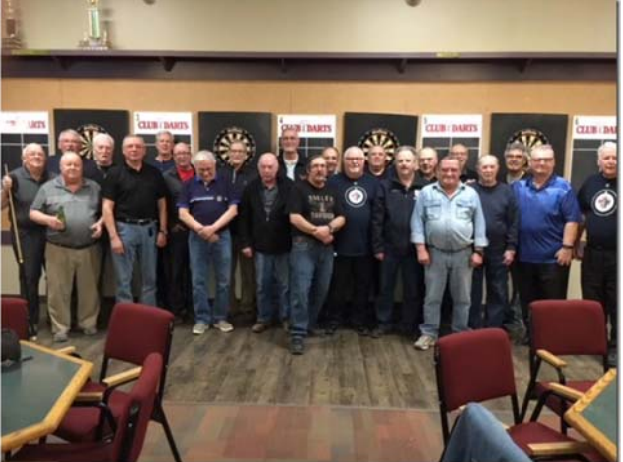
Annual snooker meet, St James Legion vs ANAF 283