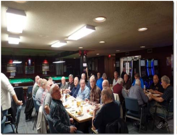
Senior league snooker players enjoying lunch at the Annual Awards luncheon.