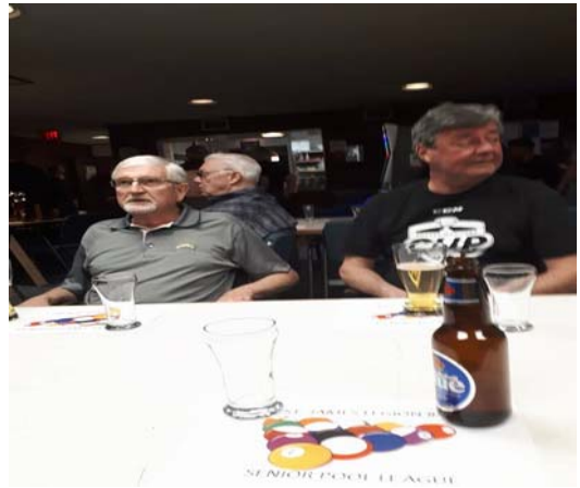
I don't like that guy, think he farted