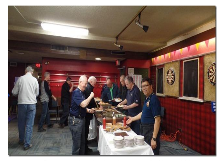
Rick's goodies for Snooker Awards dinner 2019