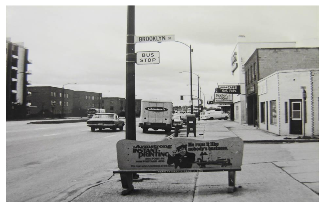
Outside the front of the Legion 1972

As all members Know by now, our Club sponsors the PPCLI Cadets. There is a small box located by the phone down stairs near the Canteen. If you have any spare CDN Tire Money, it would be greatly appreciated if you could drop it in the box. Once filled we will deliver it to the PPCLI Cadets.