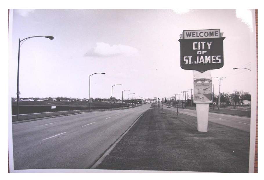
City of St. James Welcome sign

Nevada tickets, looking after the daily membership draw. Setting up daily floats and preparing banking transactions and deposits. Daily data entry of all receipts. Operate and control Membership program which includes contact with Dominion office membership. Prepare and send letters for Welcoming Ceremonies and Long Service presentations. Issue Drink tickets and manage Door card system. Handle all correspondence that is received. Prepare Accounts payable and cheques for signatures. Maintain office supplies and assist bar manager with schedules and memos. Enter all pertinent data for payroll and handle payroll reconciliation. Distribute pay stubs and/or T4 slips and/or ROE's. Assist executive members with correspondence, typing and faxes. Photocopy minutes and financial statements and related documents for all meetings. Maintain Band Board and electronic billboard and maintain Library.