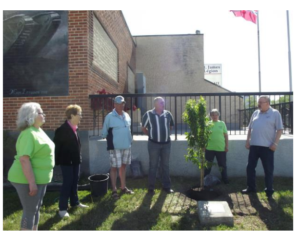
New Tree of Remembrance dedication Jun 13, 2019