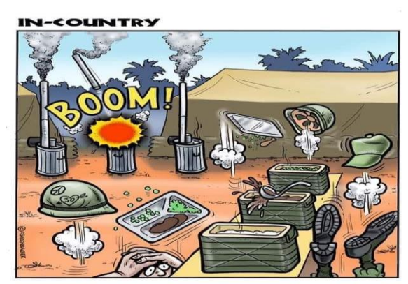
INCOMING...FROM THE IMMERSION WATER HEATER?