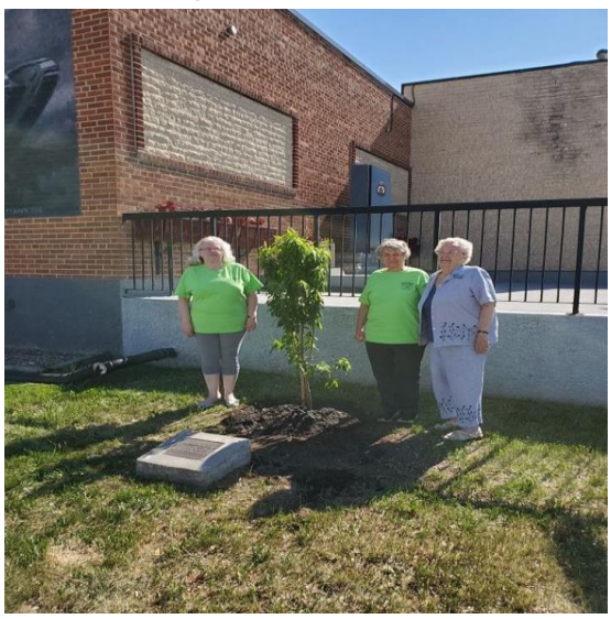
New Tree of Remembrance dedication Jun 13, 2019