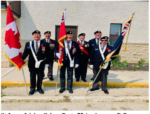
St James Légion Colour Party 75 Anniversary D-Day Stonewall June 2, 2019