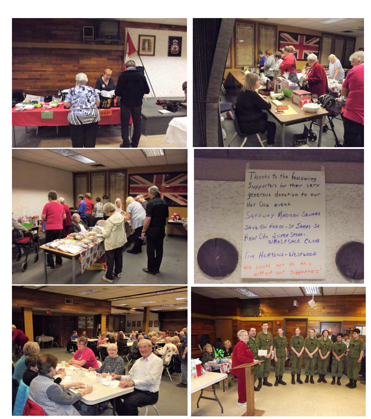
Thanks to 2701 PPCLI Cadets for helping out