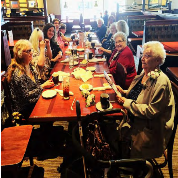
L.A wind up at Red Lobster May 7, 2023